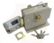
Electric Rimlock set