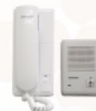
1 to 1 battery doorphone