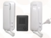
1 to 1 AC doorphone 1 to 2 AC doorphone

Accessories : Push button plate, additional remote control transmitter.